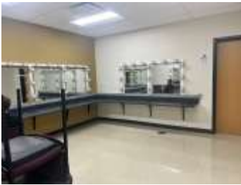
Dressing Room # 2