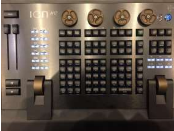
Light board command side.