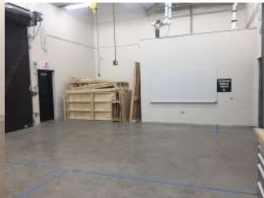
Scene Shop - Stage Left