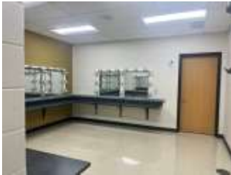
Dressing Room # 1

Richards High School be using 2 full sized dressing rooms and 1 classroom for the Drama Competition. The 2 full sized dressing rooms are equipped with mirrors, a sink, and a restroom. The classroom has a sink and mirror. A restroom is close to classroom.