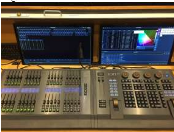
Light board - full view

Light board - you will have 15 areas, cyc colors, and 6 specials. The green fader lights are the live faders for these. You will have the option of running the show live with these faders OR each show will have a file that can be used to program your cues during your 15 minutes and set up time.