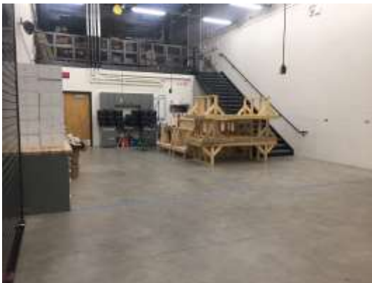
Scene Shop - Stage Right