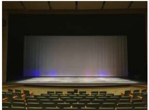
Stage - audience view from tech

This is the stage with all 15 areas on. Each area is 8x8 and you can see the tape that marks them out. Ignore the Performance in the Round circle in the center - it will be removed.