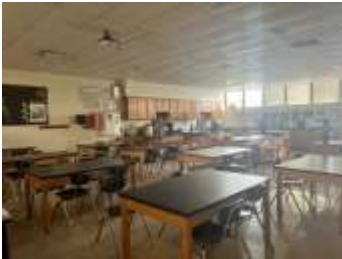
Dressing Room # 3